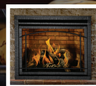
Wrought iron door frame