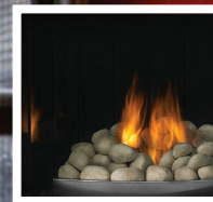
River rocks with satin chrome decorative fender